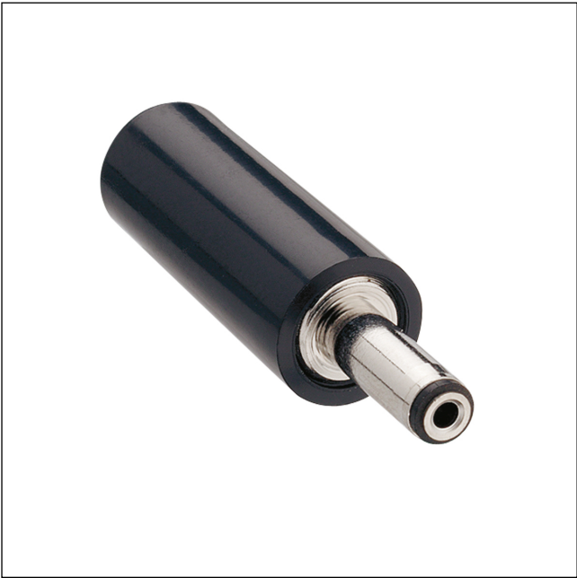
Power supply plug, 3.4 mm x 1.4 mm, straight version, with solder eyes